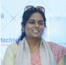
Guest of Honour, Honourable Smt R Lalitha, IAS, Director of Textiles, Department of Textiles, Government of Tamil Nadu